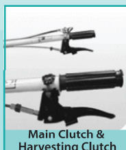
Main Clutch & Harvesting Clutch