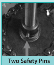
Two Safety Pins